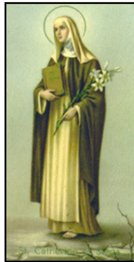
St. Catherine of Siena